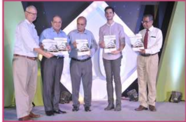
Release of Internal Newsletter 'Urja'