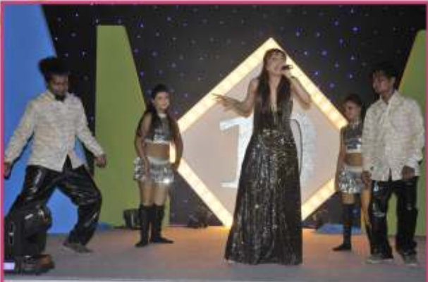
Stage Performance by Playback Singer Jankee Parikh