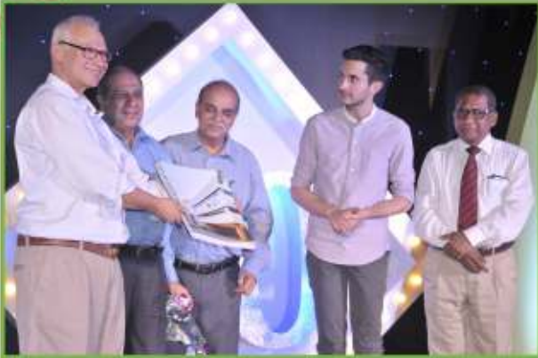
Release of GMH Diary